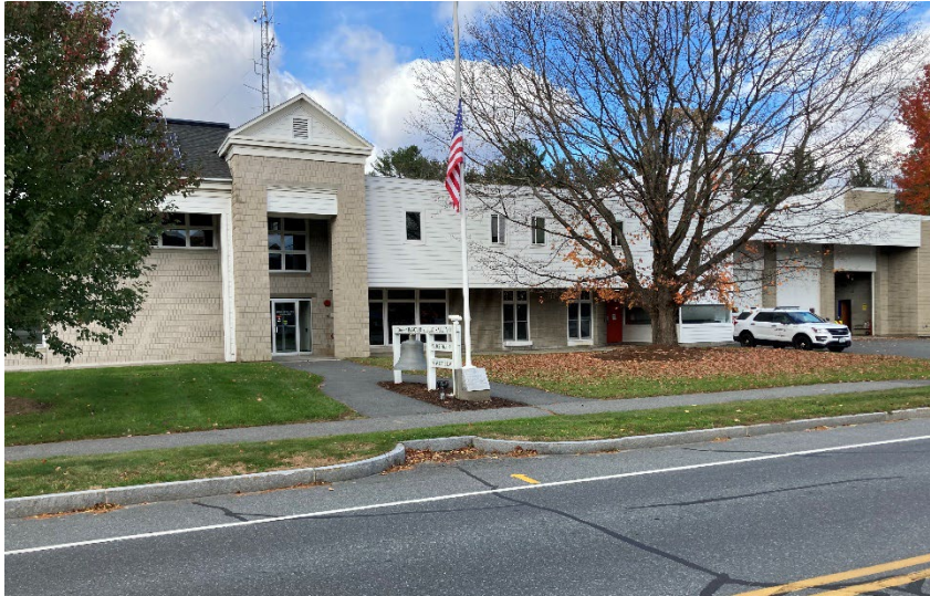
Hanover Public Safety Building – Police, Fire, and EMS.