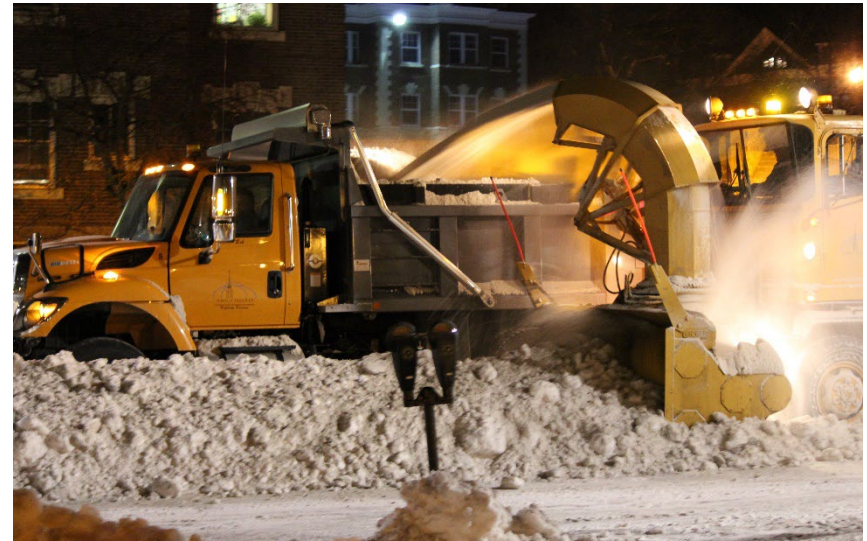
Winter Operations, Department of Public Works.