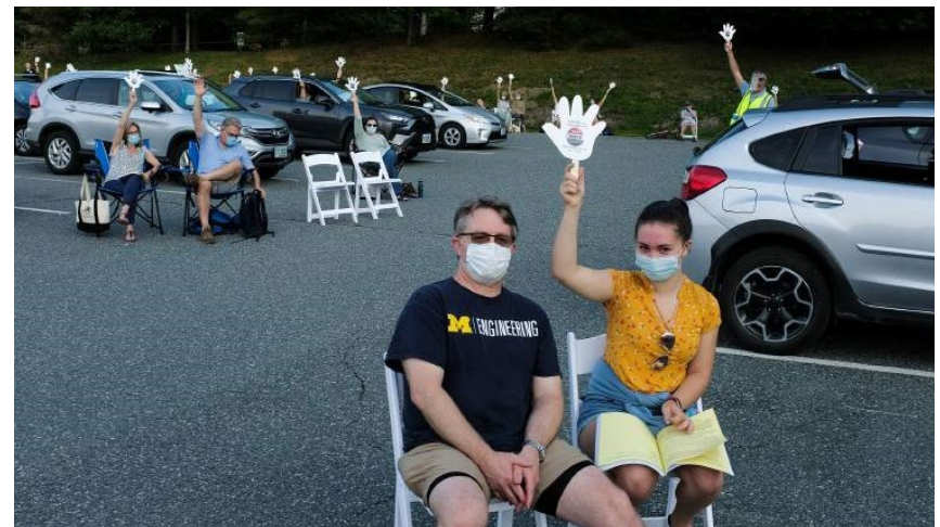
Public Participation at the 2020 Hanover Town Meeting.