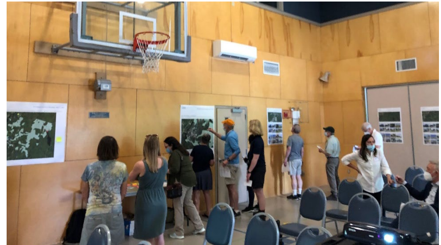
Public Participation at the May 21, 2022, Sustainability Master Plan Development Solutions Workshop.

Routinely, more residents vote by ballot at the polls that are open for 12 hours than attend the in-person 2- to 3-hour annual meeting. Only those that can make a nighttime meeting can participate. Daytime and weekend meetings have been considered but the evenings are thought to be the best time for the most people. Town Meeting is regularly scheduled – with recent COVID-19 exceptions – so ample time is given to participants to make plans to attend. To boost participation at Town Meeting, on-site childcare and transportation could be provided. Notably, Kendal at Hanover offers transportation for its residents to get to Town Meeting.