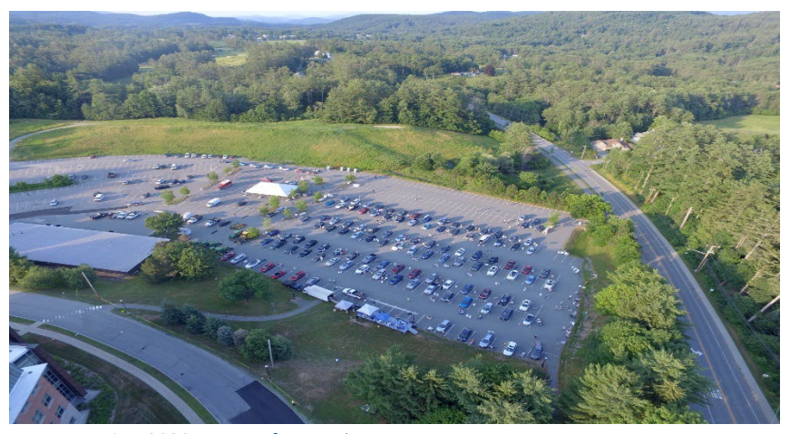
Town Meeting 2020 as seen from a drone

The town invites the entire Hanover community to immerse themselves in the contents of this Plan, beginning with the Vision Statement and Goals (presented in this chapter), as well as its Strategies and plan for implementation in Chapter 11, to understand where the town is headed. The community's ongoing support for this Plan is pivotal to getting the town to where it wants to be over the next decade.