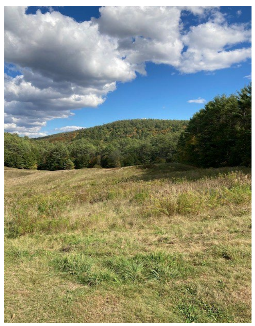
The Hanover Improvement Society's Ferguson Field