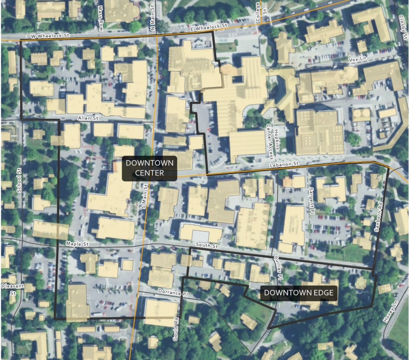
Figure F-1: Hanover's Downtown Zoning Districts